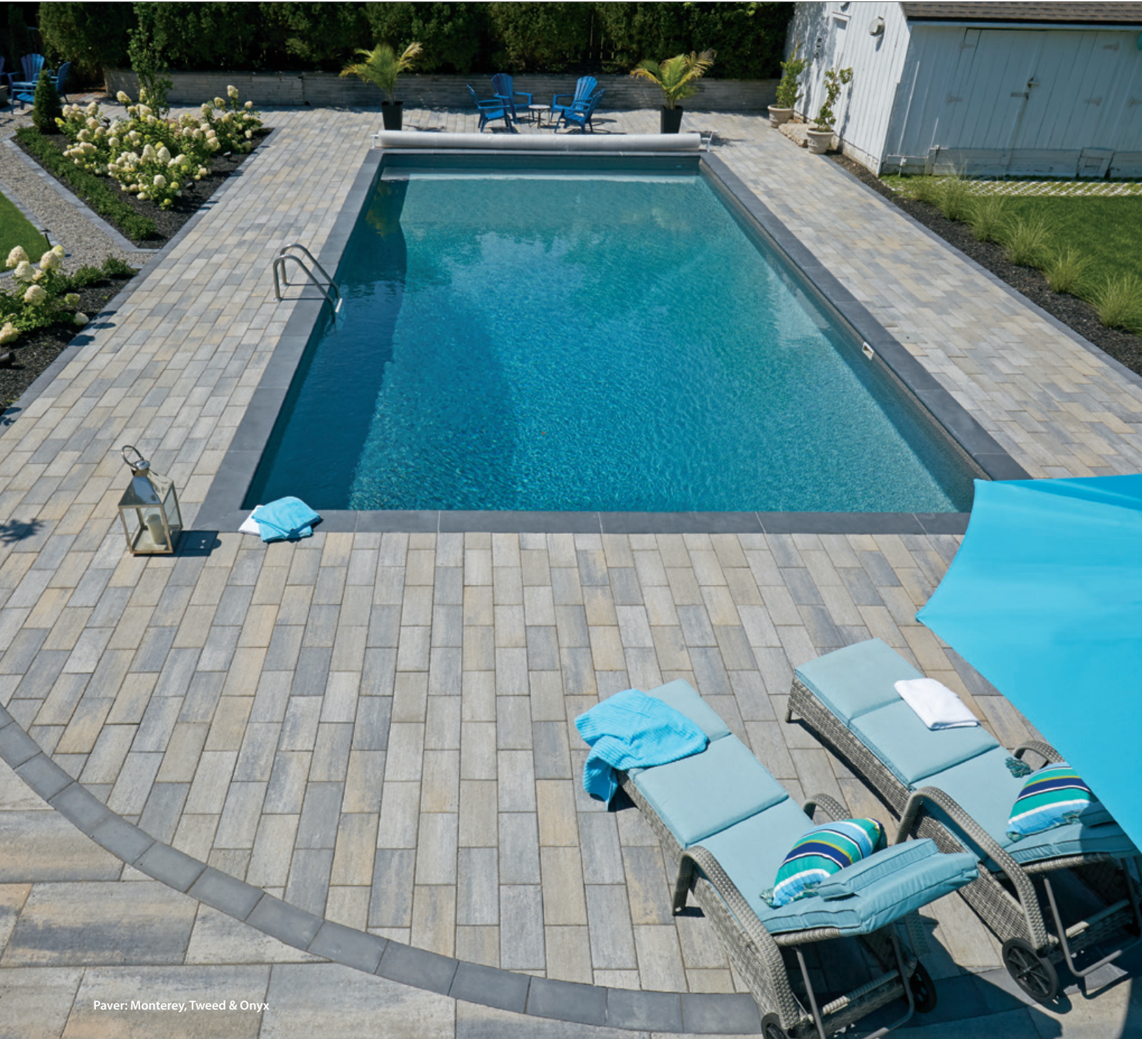
Paver: Monterey, Tweed & Onyx

Our newest architectural slab features a softly-textured surface and uniquely undulating spacers (in the 8x16 size) for use as coping, cap or step. Monterey's clean lines, appealing earth tones and availability in five sizes and three packaging options make it an ideal choice for creating a relaxed West Coast vibe. At 50mm (1.97") thick, it can be combined with Rialto for a unique effect.