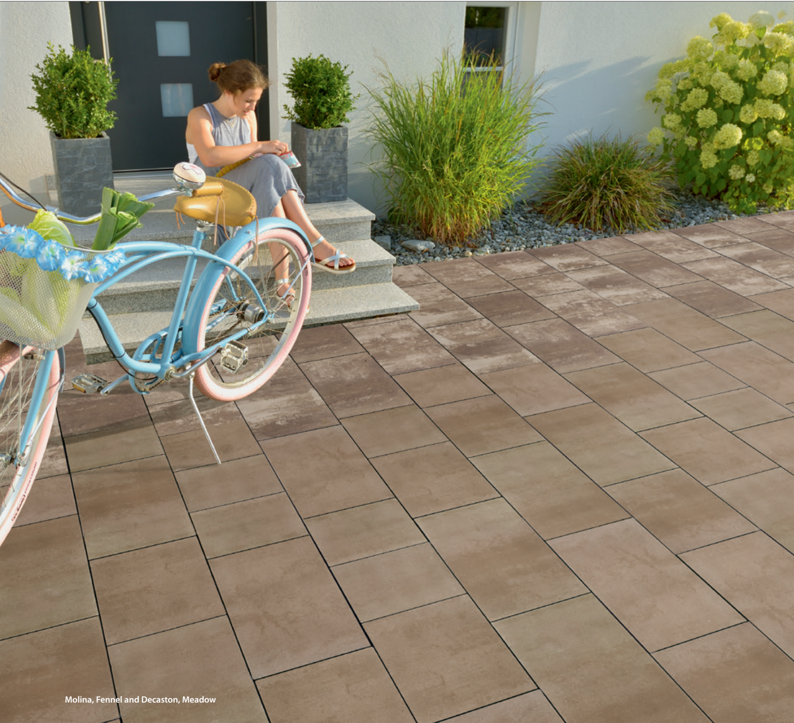
Molina, Fennel and Decaston, Meadow

The new MOLINA® line from Oaks enables holistic design concepts for your project. With its large format, smooth surface, clean edges and reduced joint spacing, Molina is ideal for creating inviting spaces. At 80mm (3.15") thick, this paver is suitable for light traffic, pedestrian use and meets wheelchair access specifications. Combine with the bold colours of Decaston for even more design options.