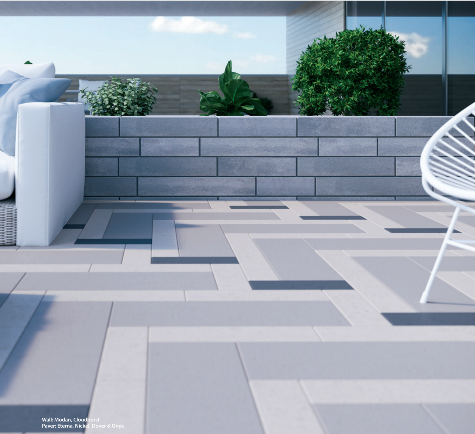
Wall: Modan, Cloudburst Paver: Eterna, Nickel, Dover & Onyx

With a striking smooth surface, faintly beveled edges and a palette of subtly-blended colors, the sleek Modan wall system is the perfect choice for contemporary outdoor designs. The four linear-proportioned wall blocks are packaged together as a random bundle, while the 440 Unit is also packaged separately making it ideal to use as accent banding for pillars, or as an independent system.