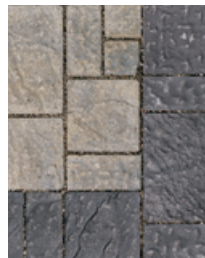
SILVERSAND WITH ONYX SAILOR COURSING

Note: Sailor coursing shown uses 4x8, 8x8 and 8x12 in a running bond.