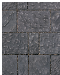
ONYX Ideal for sailor or soldier coursing.