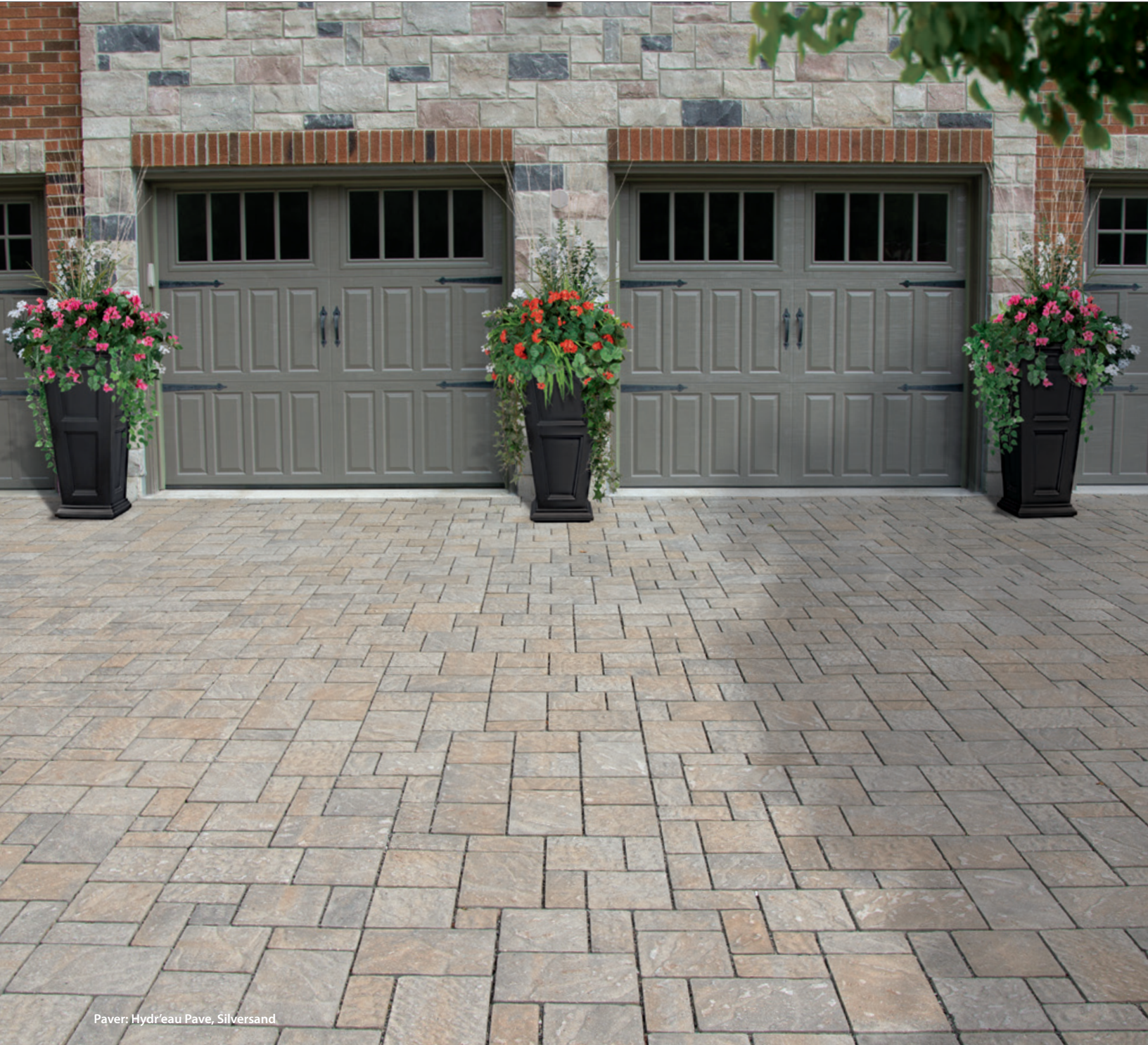
Paver: Hydr'eau Pave, Silversand

Distinctively textured with the look of natural stone, these permeable paving stones are designed to reduce excessive rainfall runoff. Hydr'eau Pave allows for optimum water flow – through joints and into the base, sub-base and sub-soil – reducing erosion and preventing sediment build-up. With an 80mm (3.15") thickness, they are ideal for pedestrian and moderate vehicle traffic. Combine with other Oaks products of the same thickness to create unique designs.