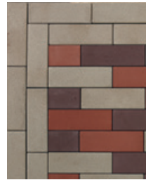
OLIVE WITH TERRA COTTA & PLUM