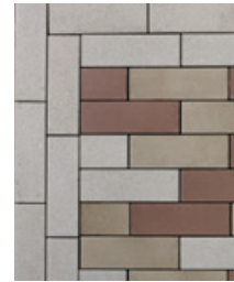
DOVER WITH DARK OAK & OLIVE