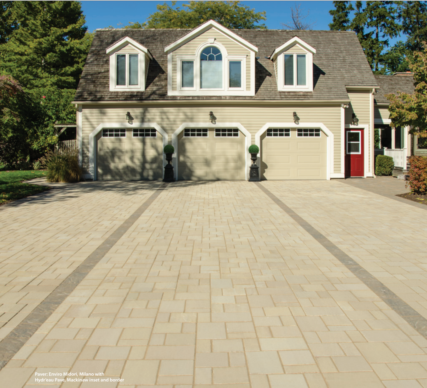
Paver: Enviro Midori, Milano with Hydr'eau Pave, Mackinaw inset and border

Combining a fresh, modern finish with drainage capabilities to eliminate surface water runoff, 80mm (3.15") thick Enviro Midori pavers are optimized for mechanical installation, with interlocking spacer bars for enhanced surface stability. Available in multiple sizes and packaging configurations, these pavers pattern and combine seamlessly with other 80mm pavers to create unique designs.