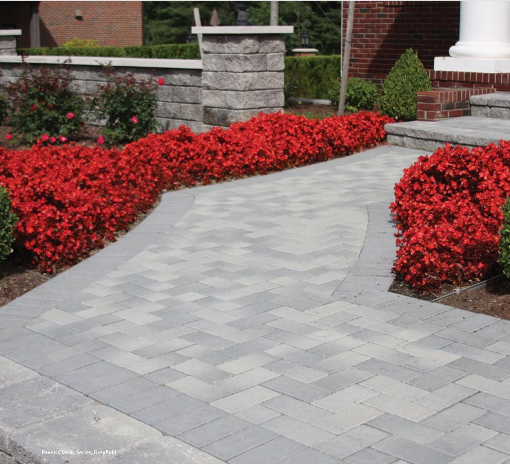
Paver: Classic Series, Greyfield

This traditional 60mm (2.36") paver, available in an elegantly blended range of colors, Classic Series is suitable for light vehicle and pedestrian traffic.