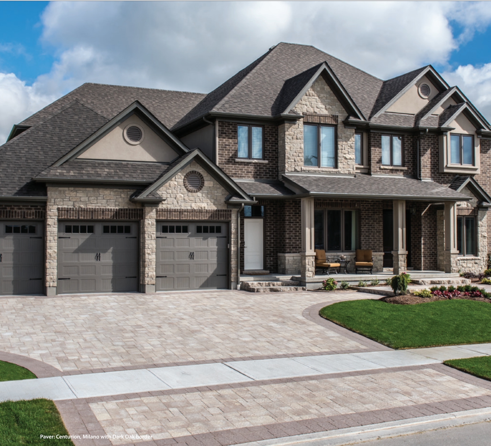
Paver: Centurion, Milano with Dark Oak border

Featuring a charming weathered surface, this 70mm (2.76") thick paver is designed to stand up to pedestrian and vehicle traffic and last a lifetime. Ranging in sizes from Small to Double Jumbo, Centurion pavers allow for limitless design options, with Standard through Double Jumbo units packaged individually. Also available in a Combo bundle as shown.