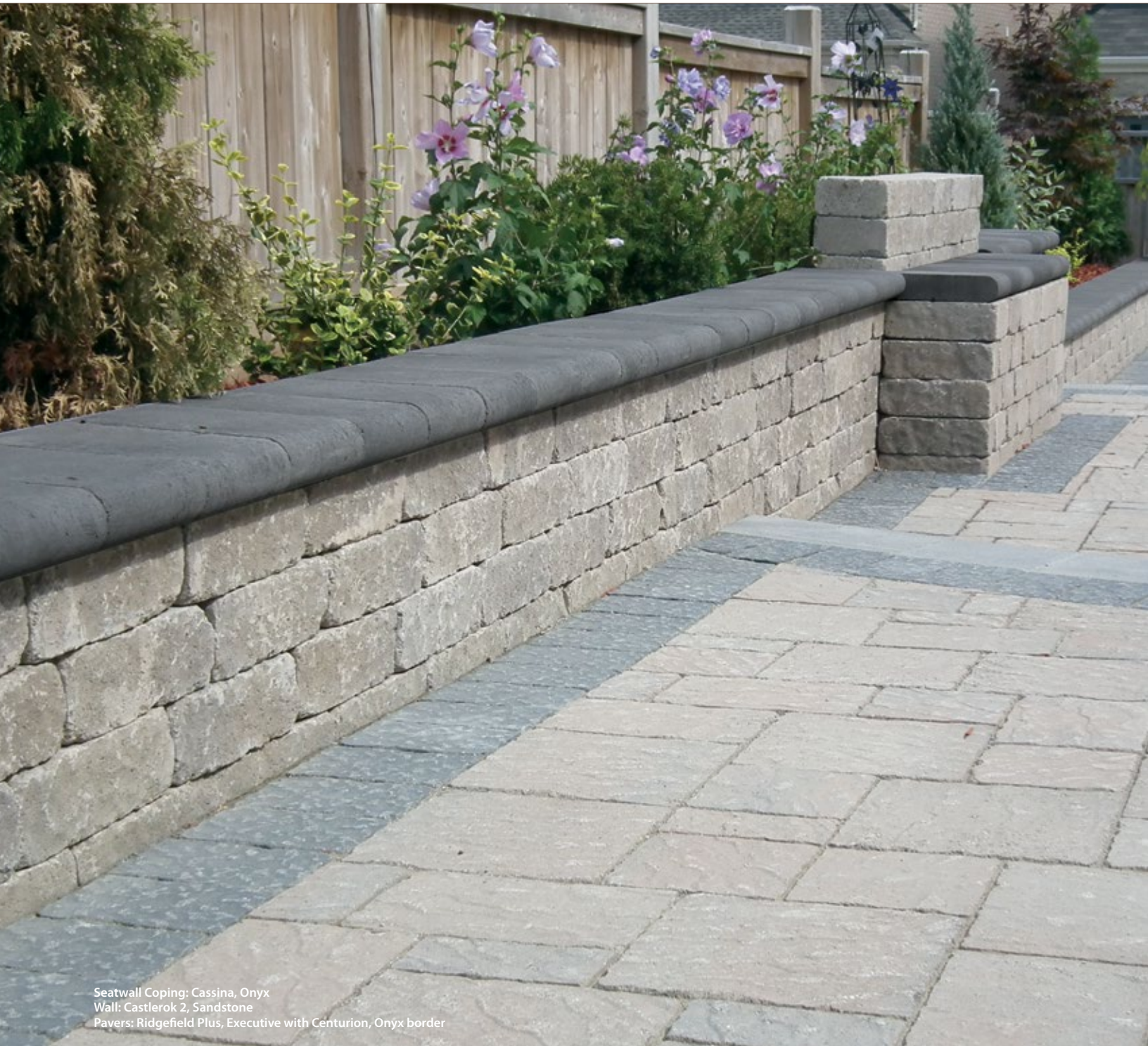
Seatwall Coping: Cassina, Onyx Wall: Castlerok 2, Sandstone Pavers: Ridgefield Plus, Executive with Centurion, Onyx border

Offering secure fit and versatility in design, this 70mm (2.76") thick coping stone features a gentle bull nose edge ideal for pool edging, step treads, seat walls and other applications. Cassina can be used in combination with other Oaks 70mm (2.76") and 60mm (2.36") pavers and small retaining wall products.