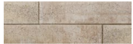
MILANO SMOOTH (TOP) MILANO EMBOSSED (BOTTOM)