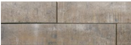
CHAMPAGNE SMOOTH (TOP) CHAMPAGNE EMBOSSED (BOTTOM)