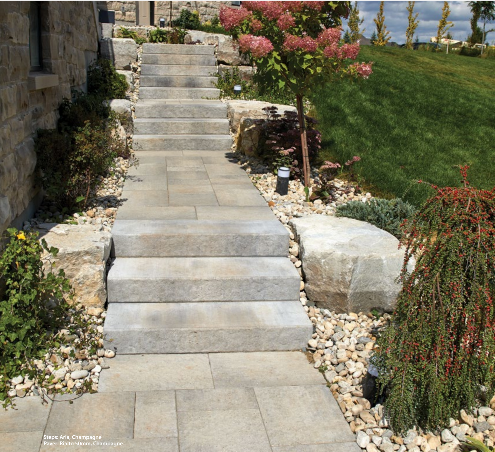
Steps: Aria, Champagne Paver: Rialto 50mm, Champagne

When developing Aria Step, Oaks considered several key factors: ease of installation, design flexibility, aesthetics and new safety standards. The result: a modern step system truly designed for its purpose, with dimensions that balance elegance and comfort, and smooth/textured surfaces to compliment landscape designs. Whether they are used for gentle transitions or steep slopes, Aria Step units are designed to overlap, ensuring aesthetics and stability over time by reducing irregular settlement.