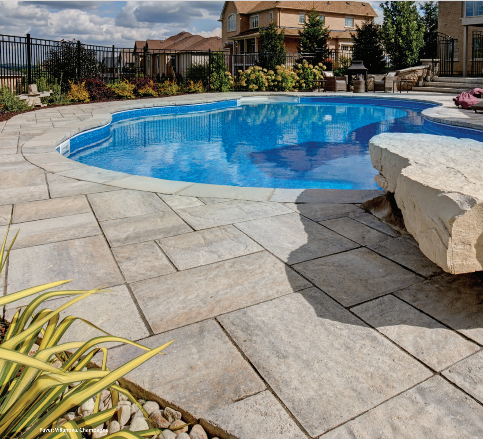
Paver: Villanova, Champagne

A natural stone look, with accentuated contours that define Villanova's unique characteristics. This large scale paver has an 80mm (3.15") thickness suitable for both vehicle and pedestrian traffic. Villanova's three piece paving system allows a natural stone look with ranges of earth tones that emphasize any landscape décor. Design flexibility is endless with Villanova's 8x16, 16x16 and 24x16 sizes. Give your project an upscale look using the fifteen different textures of the 8x16 rectangle in the timeless herringbone pattern or enhance the scale by adding the square and large rectangle units.