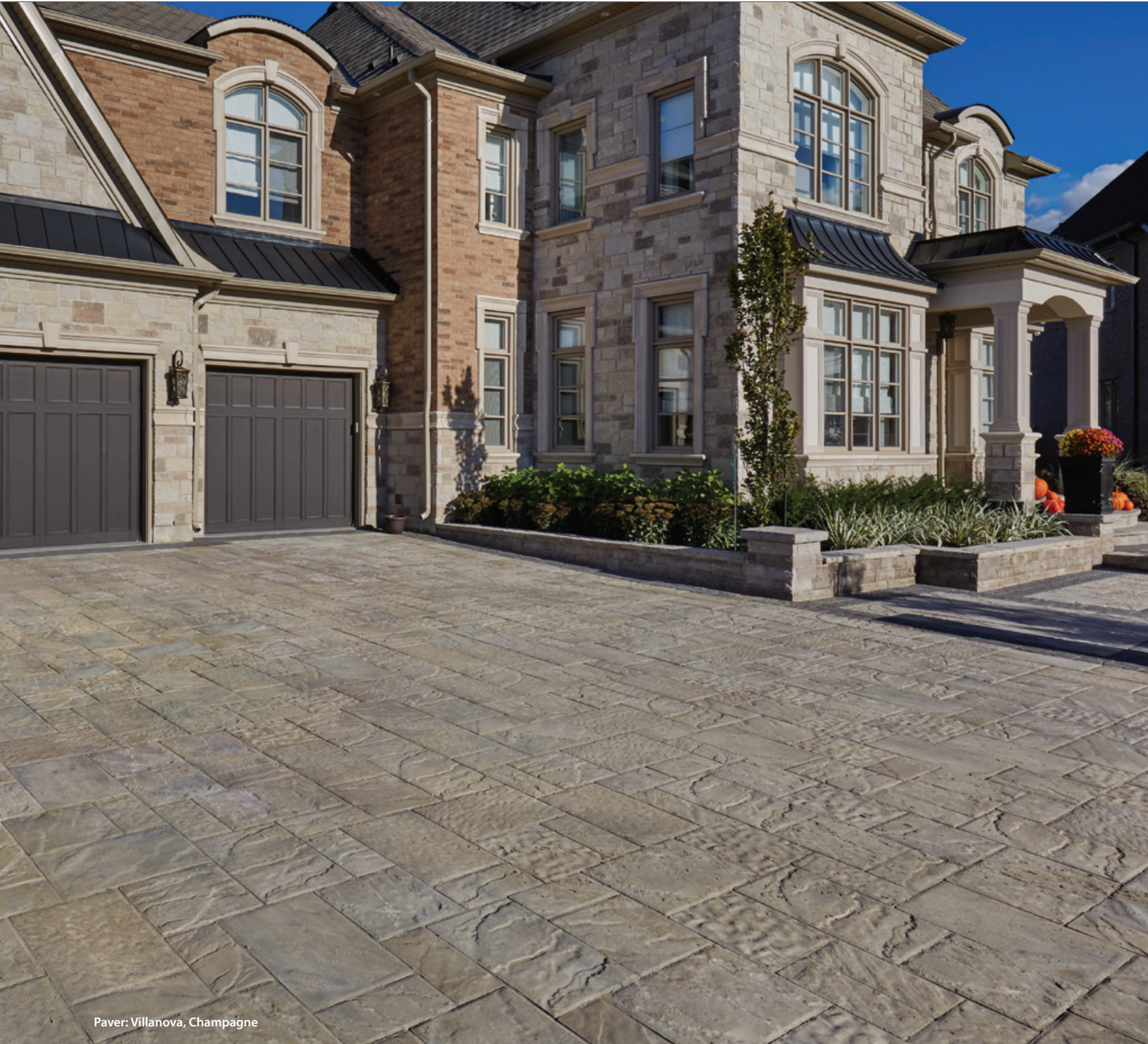
Paver: Villanova, Champagne

This large-scale 80mm (3.15") thick paver offers a natural stone look with accentuated contours and is suitable for both pedestrian and vehicle traffic. Design flexibility is limitless with Villanova's 3-piece paving system: 8x16, 16x16 and 24x16 sizes. Create an upscale look by using 15 different textures of the 8x16 size in a herringbone pattern, or enhance the scale by adding square and large rectangular units.