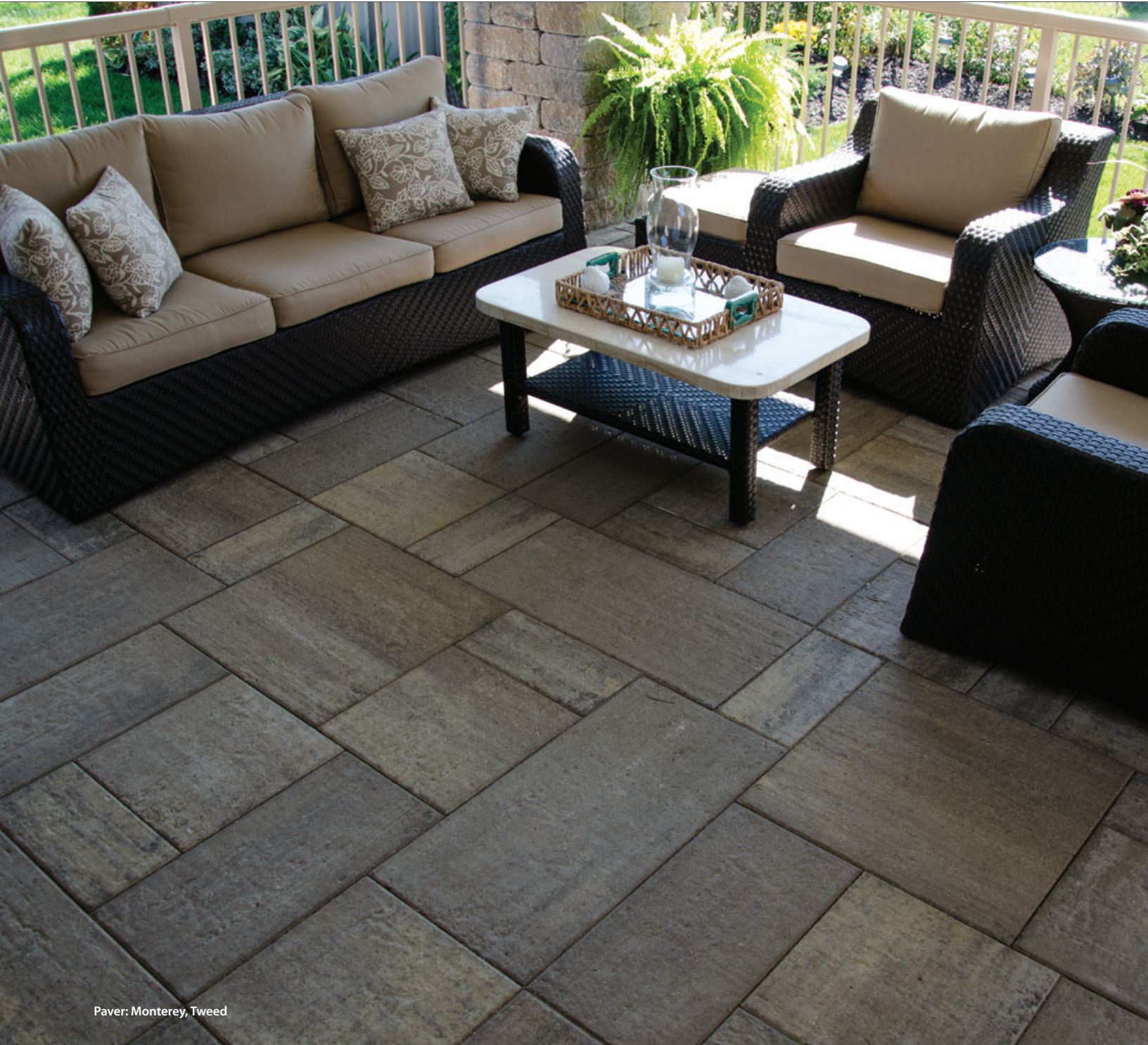
Paver: Monterey, Tweed

Our newest architectural slab features a softly-textured surface and uniquely undulating spacers (in the 8x16 size) for use as coping, cap or step. Monterey's clean lines, appealing earth tones and availability in five sizes and three packaging options make it an ideal choice for creating a relaxed West Coast vibe. At 50mm (1.97") thick, it can be combined with Rialto for a unique effect.