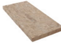
16x32 Large Rectangle Stone Width 406mm (16") Length 812mm (32") Individually Packaged