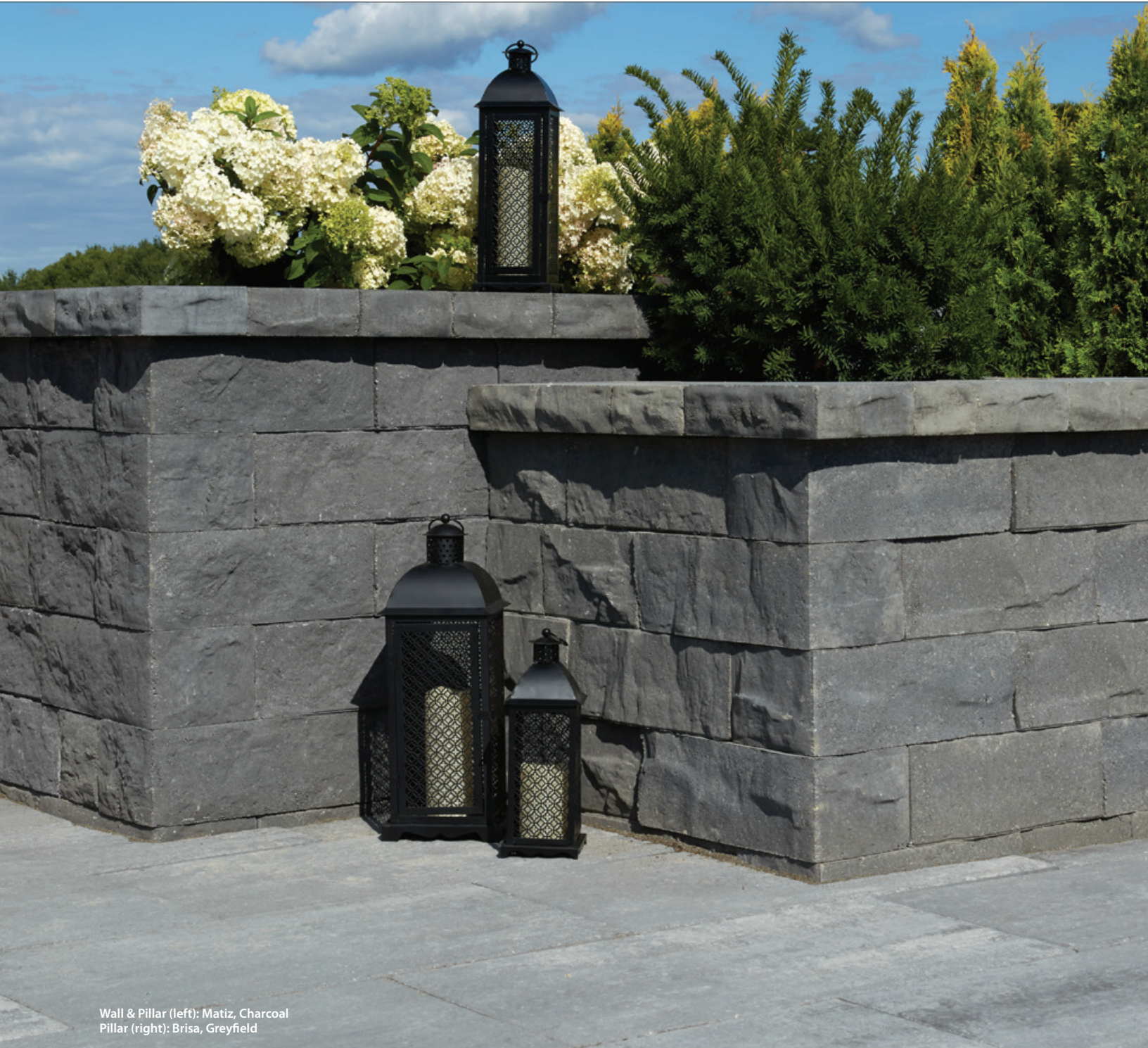
Wall & Pillar (left): Matiz, Charcoal Pillar (right): Brisa, Greyfield

This multi-piece wall system is finished with a jagged, artisanal surface resembling quarried limestone. Recommended for use in either a retaining or free-standing wall application, with matching coping and wall end units, Matiz™ is ideal for accenting even the most challenging designs.