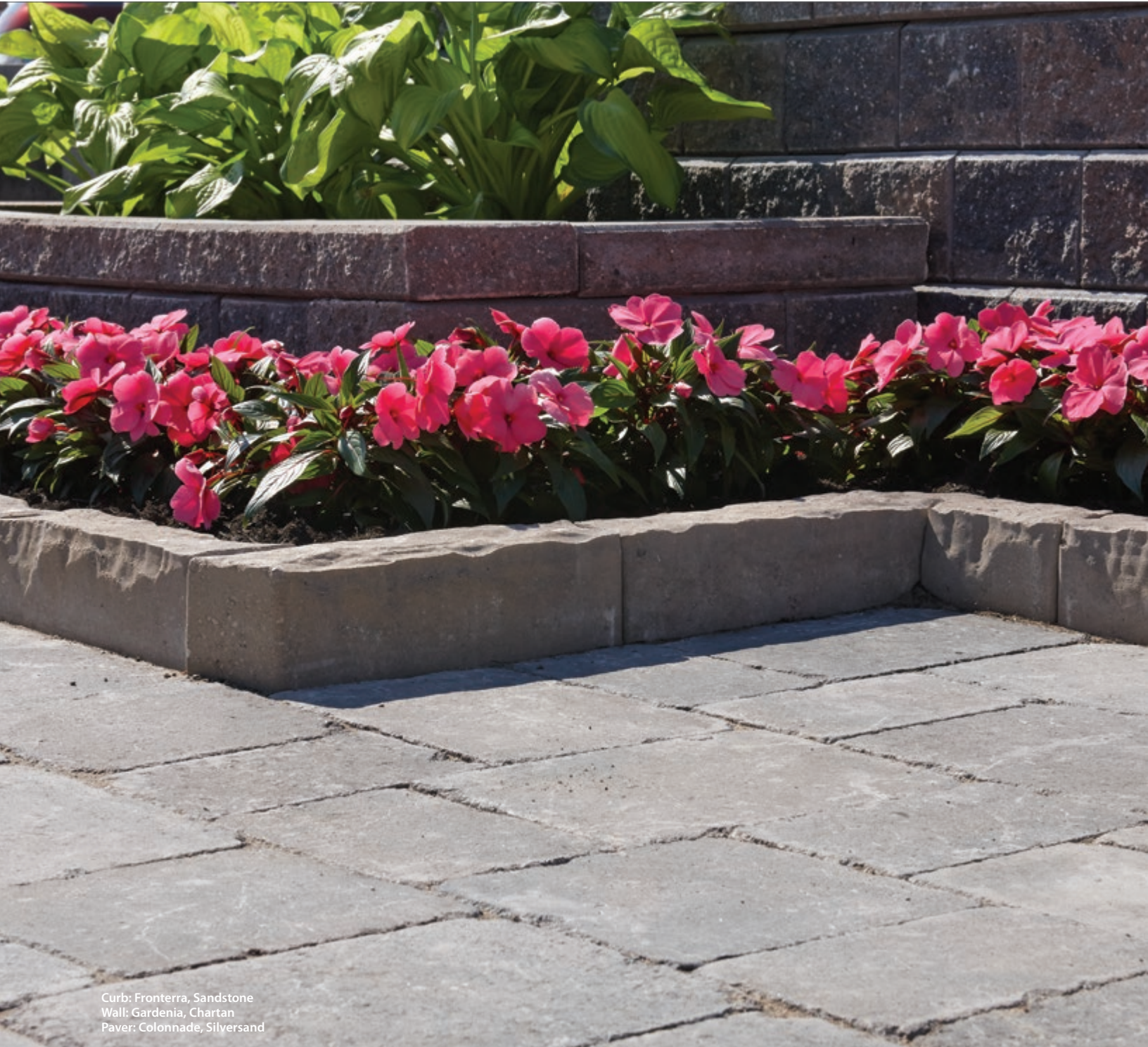
Curb: Fronterra, Sandstone Wall: Gardenia, Chartan Paver: Colonnade, Silversand

With a naturally-textured profile and complimentary color palette, Fronterra offers an ideal accent for Oaks pavers and walls. Its unique wedge shape adapts to straight and curved applications to enhance any landscape design.