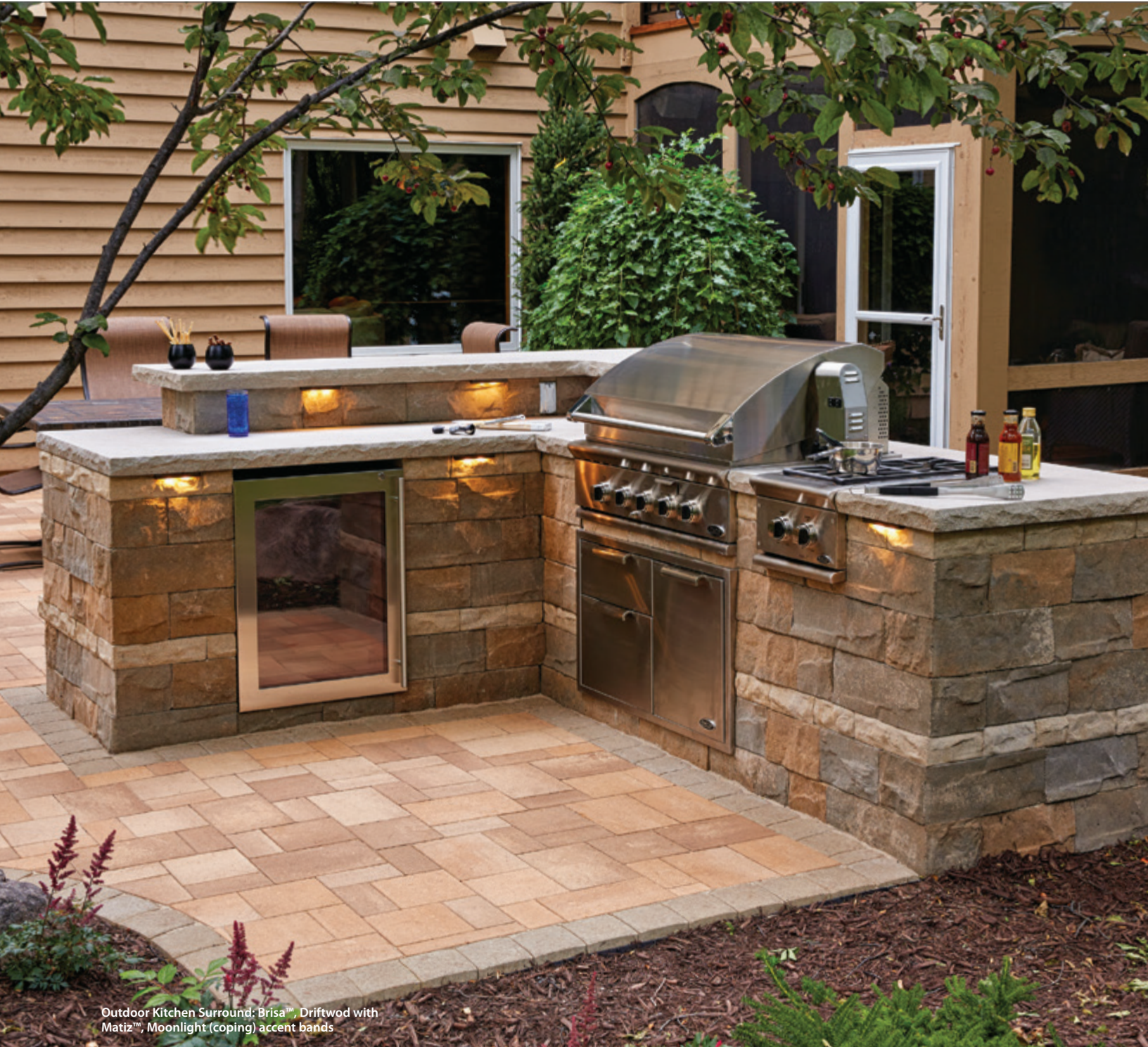
Outdoor Kitchen Surround: Brisa™, Driftwood with Matiz™, Moonlight (coping) accent bands

With a natural look of split limestone and a variety of block sizes, the Brisa™ multi-piece wall system is a versatile choice for both retaining and free-standing walls. Use this system to create straight walls, fire pits, outdoor kitchens, raised patios, steps, terraced walls, courtyards, seating walls, water features, and more!