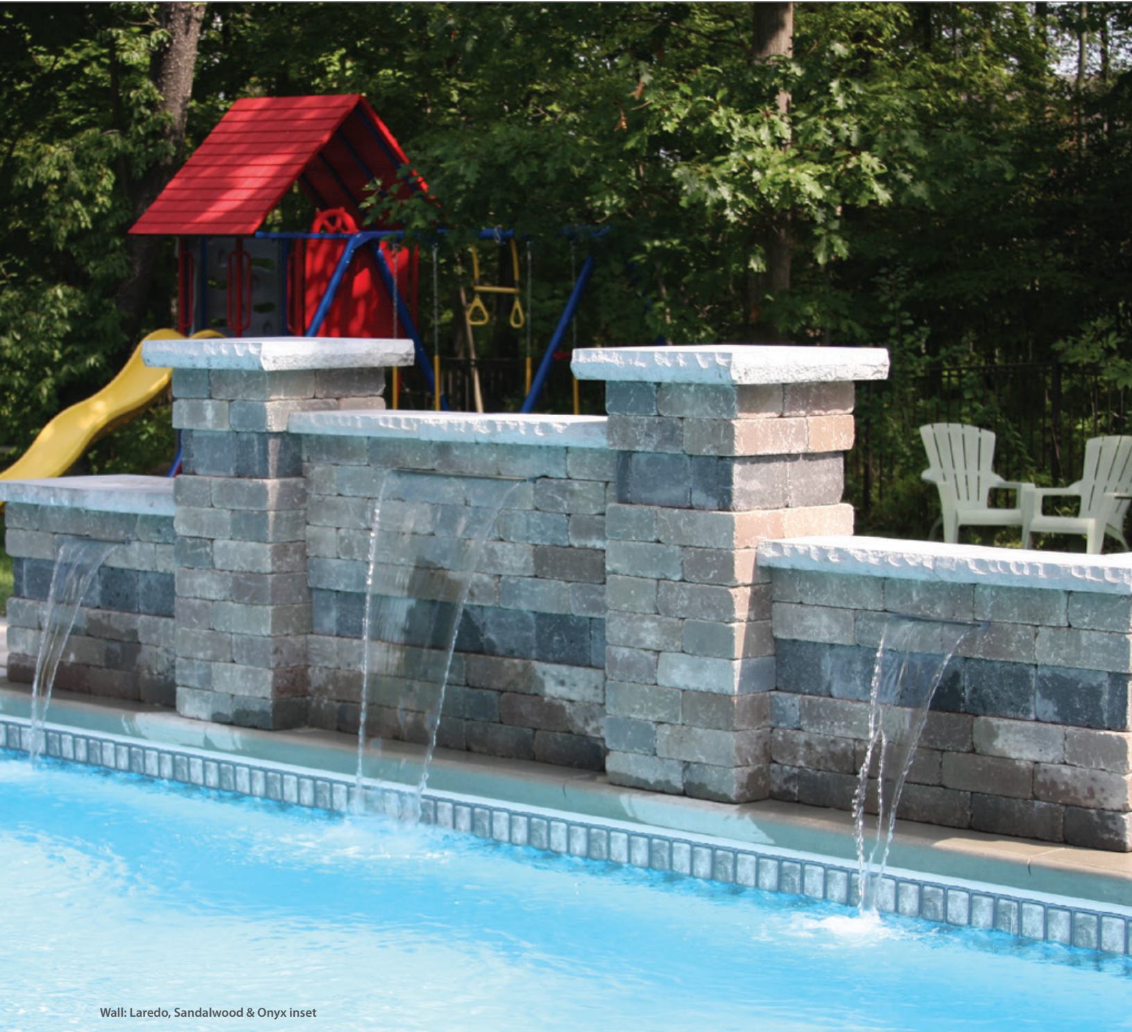
Wall: Laredo, Sandalwood & Onyx inset

Conjuring a feeling of days gone by, Laredo is a two block system which makes the construction of spectacular garden walls, pillars and driveway edging convenient and hassle-free. Laredo allows installation in either linear or random patterns for walls or sweeping curved walls. Concrete adhesive provides the ultimate in stability when used in conjunction with this product. Unequaled elegance brings Laredo to the fore.