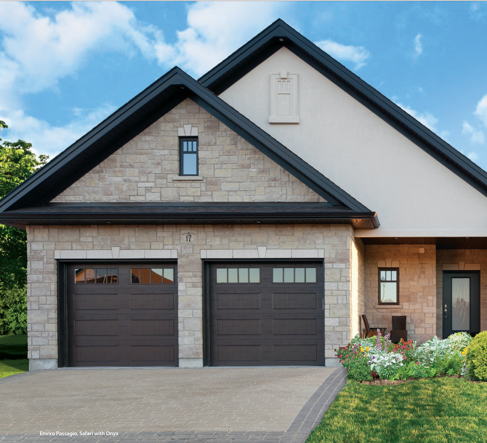
Enviro Passagio, Safari with Onyx

A modern take on European styling, in an alluring 70mm (2.76") cobble-style paver with the added benefit of permeability! Enviro Passagio's subtly blended colors combine gracefully with unparalleled texture to set a new standard in texture and detailing. The perfect choice to beautifully address rainfall runoff and puddles to keep driveways and patios beautiful, while providing optimum water flow through the joints.