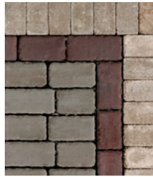
SAFARI & COLLEGE RED WITH WEXFORD, SANTA FE